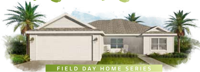
FIELD DAY HOME SERIES

3 bed | 2 bath | Florida room | 2 car garage | 2317 total sq. ft. | 1584 sq. ft. under air