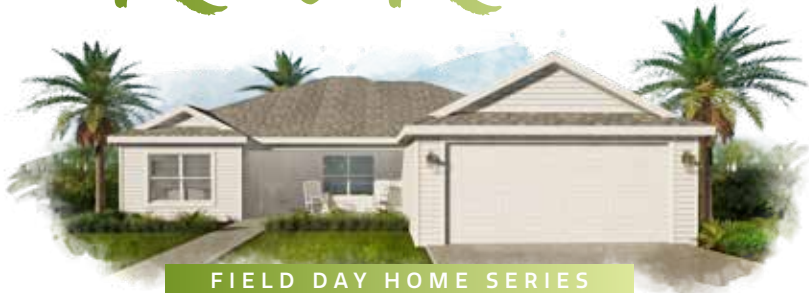
FIELD DAY HOME SERIES

3 bed | 2 bath | Florida room | 2 car garage | 2317 total sq. ft. | 1584 sq. ft. under air