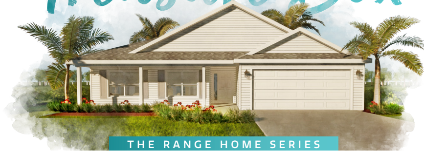
THE RANGE HOME SERIES

3 bed | 2 bath | 2 car garage | 2728 total sq. ft. | 1872 sq. ft. under air