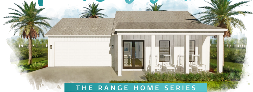
THE RANGE HOME SERIES

3 bed | 2 bath | 2 car garage | 3059 total sq. ft. | 2062 sq. ft. under air