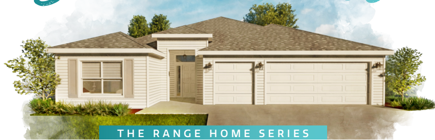
THE RANGE HOME SERIES

3 bed | 2 bath | 2 car garage + golf car garage | 2789 total sq. ft. | 1966 sq. ft. under air