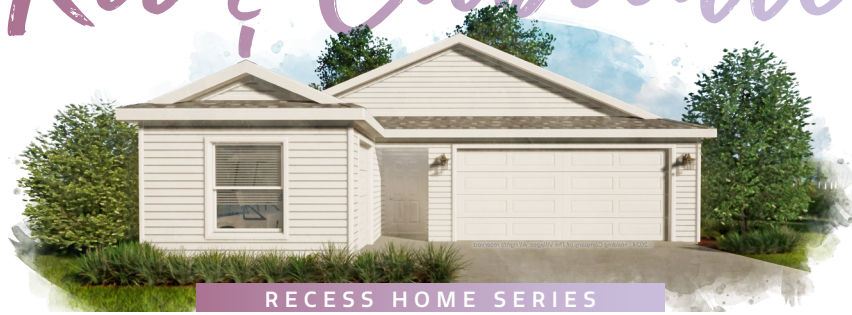
RECESS HOME SERIES

3 bed | 2 bath | 2 car + golf car garage | 1998 total sq. ft. | 1453 sq. ft. under air