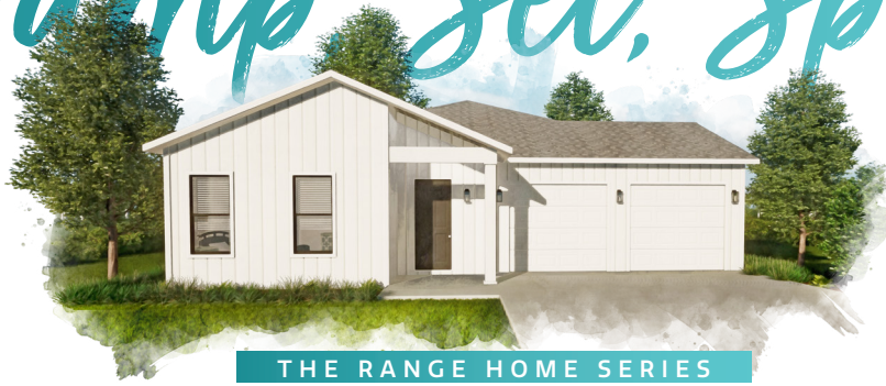
THE RANGE HOME SERIES

3 bed | 2.5 bath | 2 car garage | 3029 total sq. ft. | 2141 sq. ft. under air