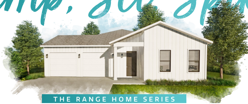
THE RANGE HOME SERIES

3 bed | 2.5 bath | 2 car garage | 3029 total sq. ft. | 2141 sq. ft. under air