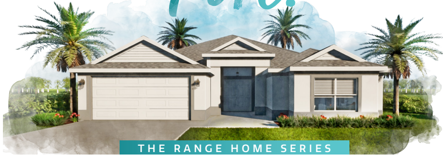
THE RANGE HOME SERIES

4 bed | 2 bath | 2 car garage | 3560 total sq. ft. | 2590 sq. ft. under air