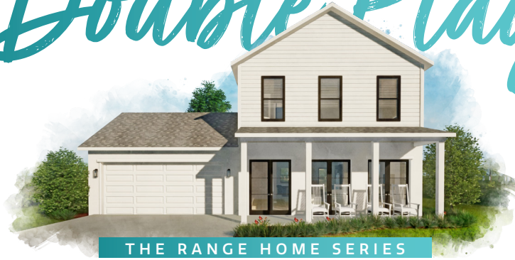
THE RANGE HOME SERIES

5 bed | 3.5 bath | 2 car garage | 3945 total sq. ft. | 2989 sq. ft. under air