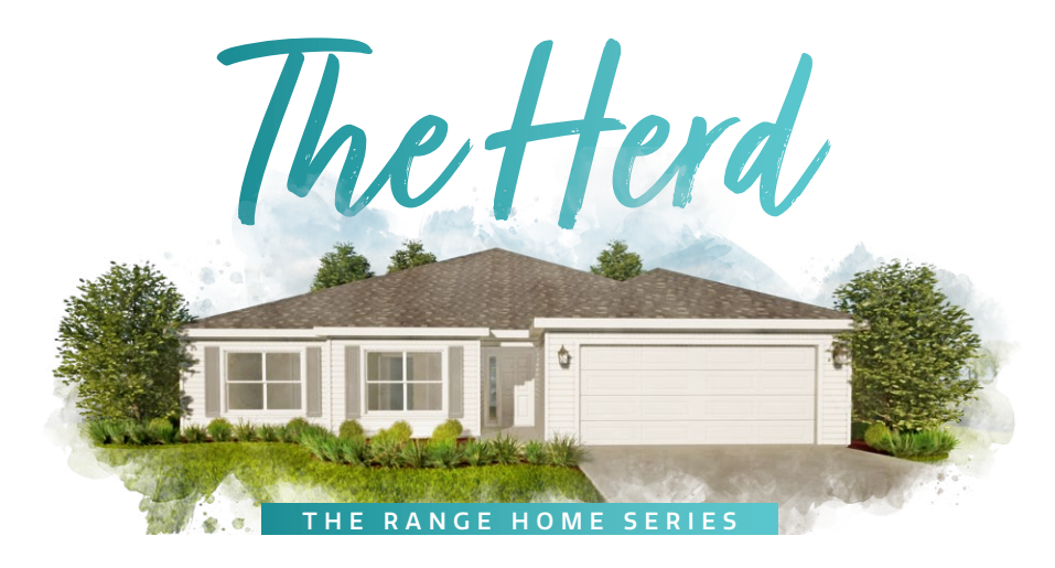
4 bed | 2 bath | 2 car garage | 2809 total sq. ft. | 1998 sq. ft. under air