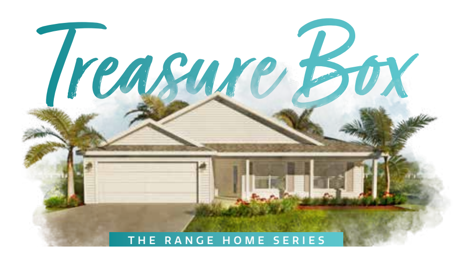
3 bed | 2 bath | 2 car garage | 2728 total sq. ft. | 1872 sq. ft. under air