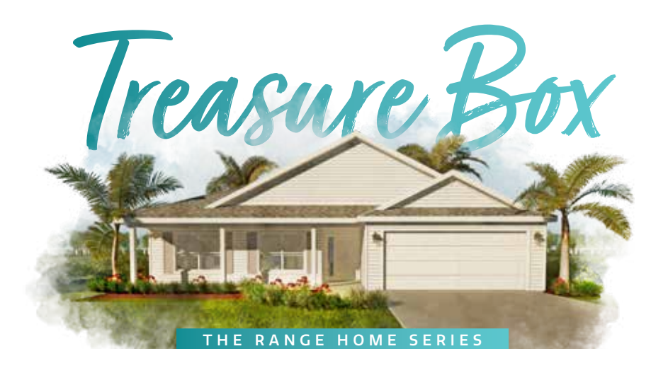
3 bed | 2 bath | 2 car garage | 2728 total sq. ft. | 1872 sq. ft. under air