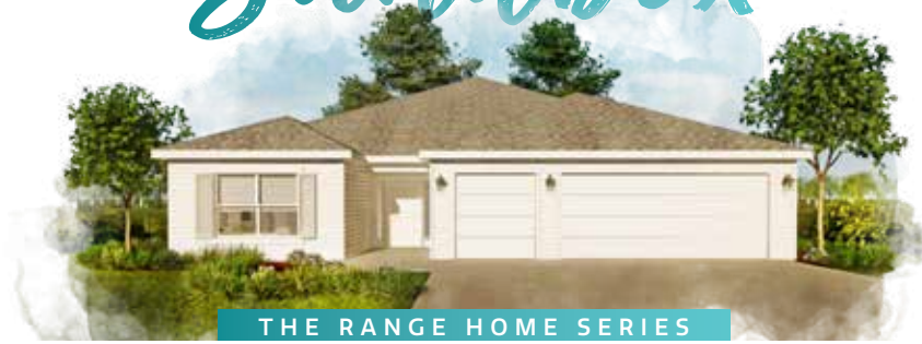
THE RANGE HOME SERIES

3 bed | 2 bath | 2 car garage + golf car garage | 2753 total sq. ft. | 1923 sq. ft. under air