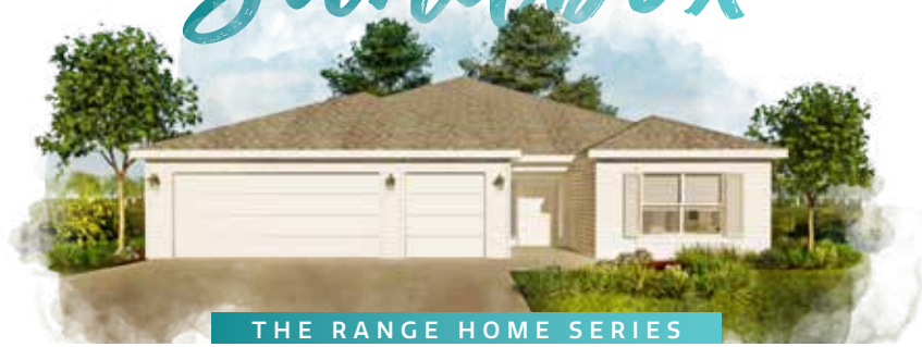
THE RANGE HOME SERIES

3 bed | 2 bath | 2 car garage + golf car garage | 2753 total sq. ft. | 1923 sq. ft. under air