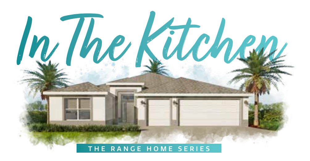
3 bed | 2 bath | 2 car garage + golf car garage | 2792 total sq. ft. | 1967 sq. ft. under air