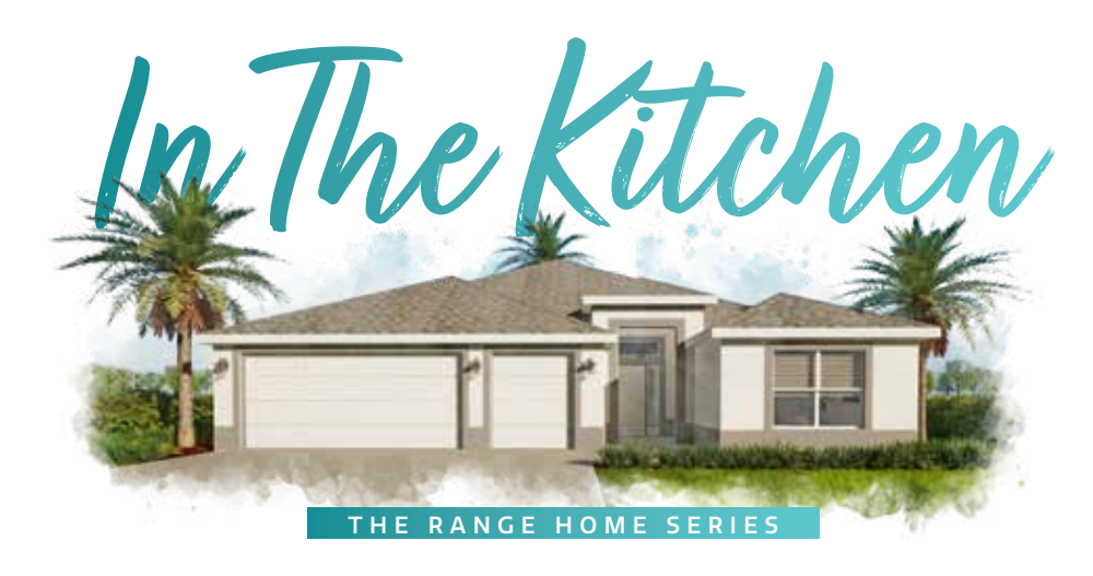
3 bed | 2 bath | 2 car garage + golf car garage | 2792 total sq. ft. | 1967 sq. ft. under air