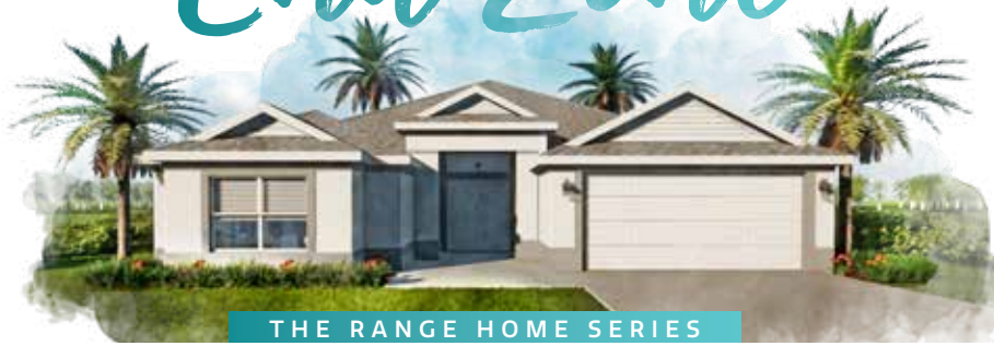
THE RANGE HOME SERIES

4 bed | 3 bath | 2 car garage + golf car garage | 3358 total sq. ft. | 2273 sq. ft. under air