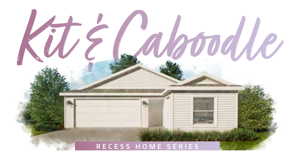
3 bed | 2 bath | 2 car + golf car garage | 1998 total sq. ft. | 1453 sq. ft. under air