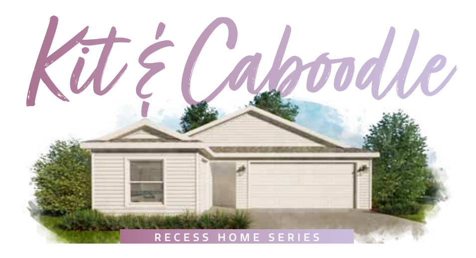
3 bed | 2 bath | 2 car + golf car garage | 1998 total sq. ft. | 1453 sq. ft. under air