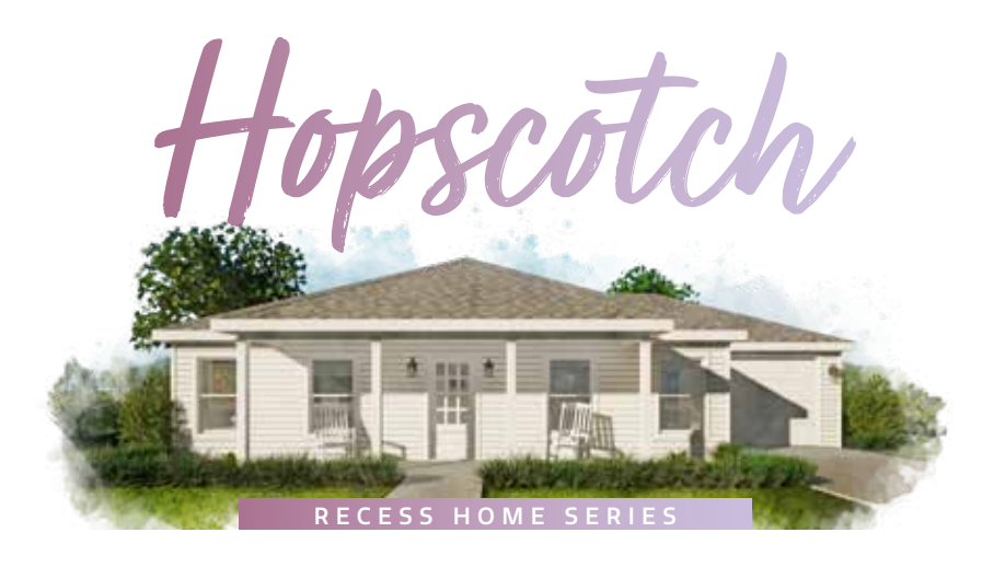
3 bed | 2 bath | 1 car garage | 1847 total sq. ft. | 1300 sq. ft. under air