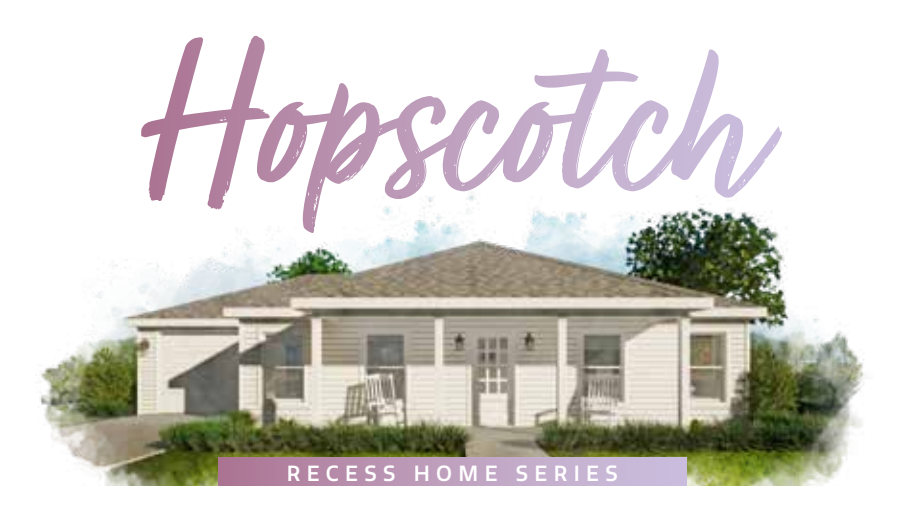
3 bed | 2 bath | 1 car garage | 1847 total sq. ft. | 1300 sq. ft. under air