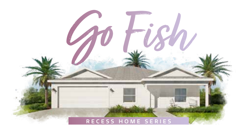
3 bed | 2 bath | 2 car garage | 2138 total sq. ft. | 1478 sq. ft. under air