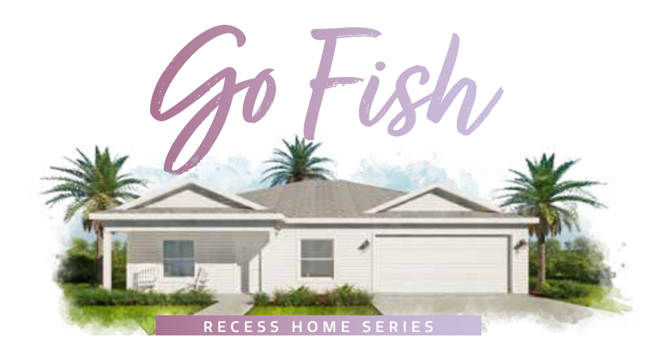
3 bed | 2 bath | 2 car garage | 2138 total sq. ft. | 1478 sq. ft. under air