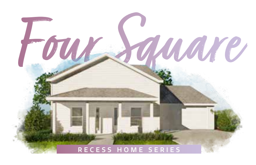
4 bed | 3 bath | Bonus room | 2 car garage | 2892 total sq. ft. | 2181 sq. ft. under air