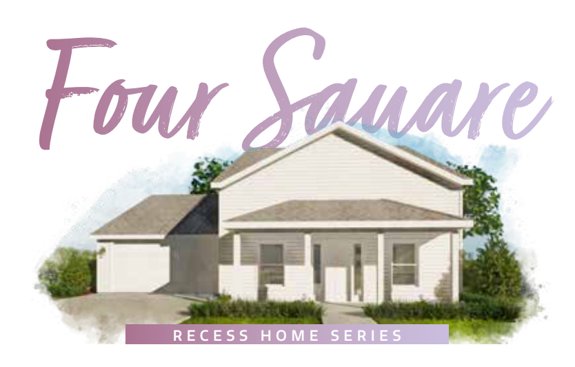
4 bed | 3 bath | Bonus room | 2 car garage | 2892 total sq. ft. | 2181 sq. ft. under air