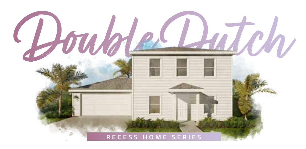
3 bed | 2.5 bath | Study | Flex room | 2 car garage | 2630 total sq. ft. | 2052 sq. ft. under air