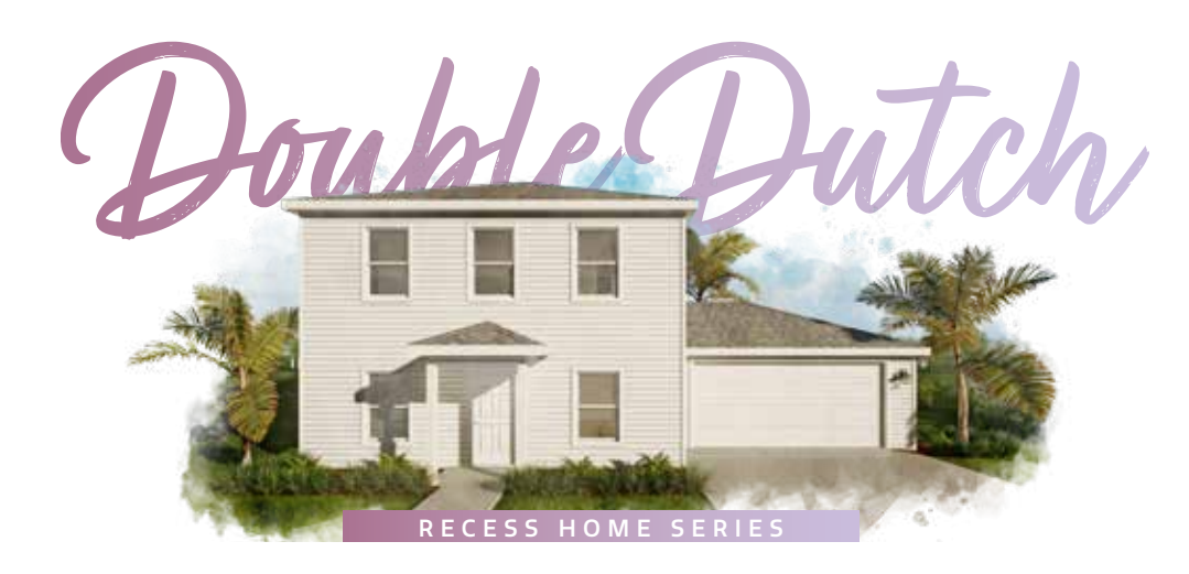
3 bed | 2.5 bath | Study | Flex room | 2 car garage | 2630 total sq. ft. | 2052 sq. ft. under air