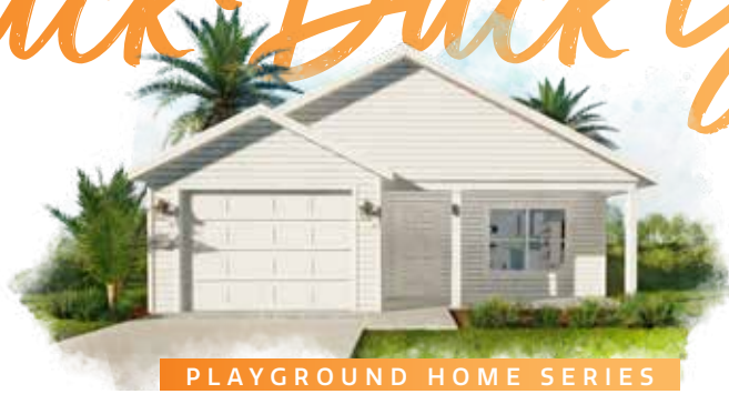
PLAYGROUND HOME SERIES

2 bed | 2 bath | 1 car garage + golf car garage | 1463 total sq. ft. | 974 sq. ft. under air