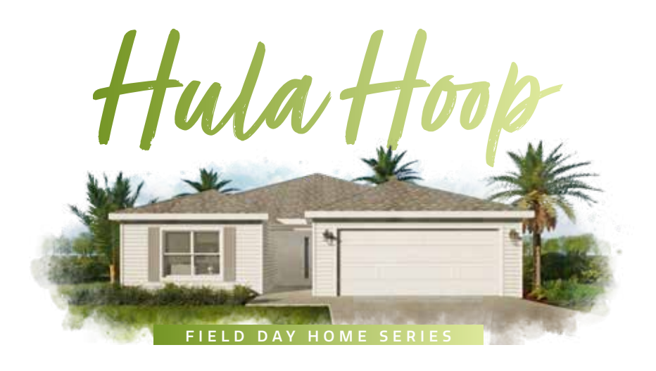
3 bed | 2 bath | 2 car garage | 2067 total sq. ft. | 1476 sq. ft. under air