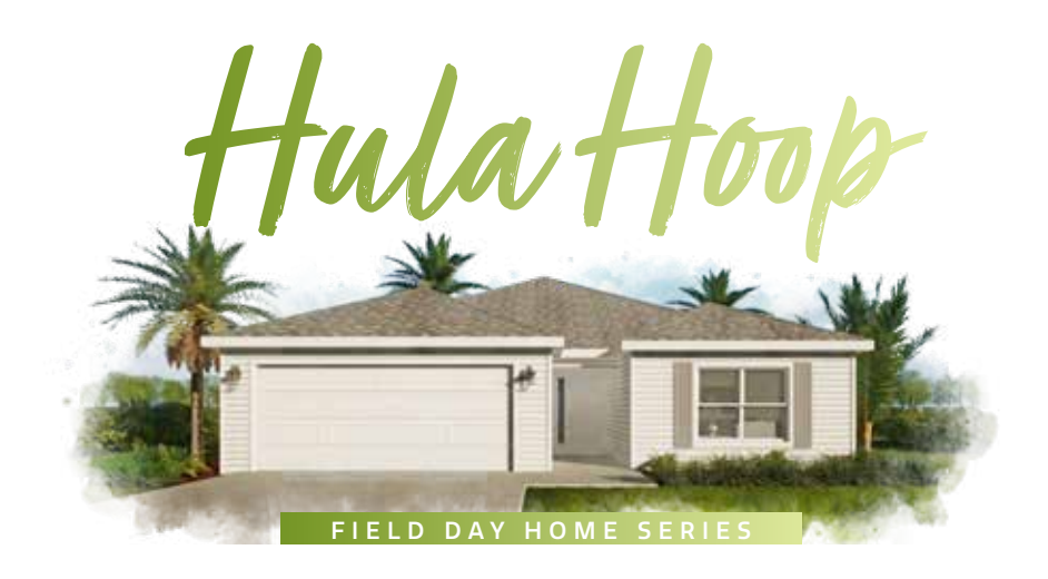
3 bed | 2 bath | 2 car garage | 2067 total sq. ft. | 1476 sq. ft. under air