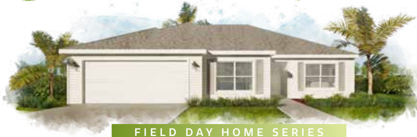
FIELD DAY HOME SERIES

3 bed | 2 bath | 2 car garage | 2239 total sq. ft. | 1570 sq. ft. under air