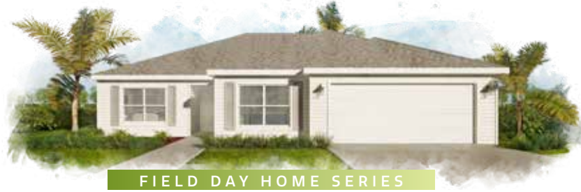
FIELD DAY HOME SERIES

3 bed | 2 bath | 2 car garage | 2239 total sq. ft. | 1570 sq. ft. under air