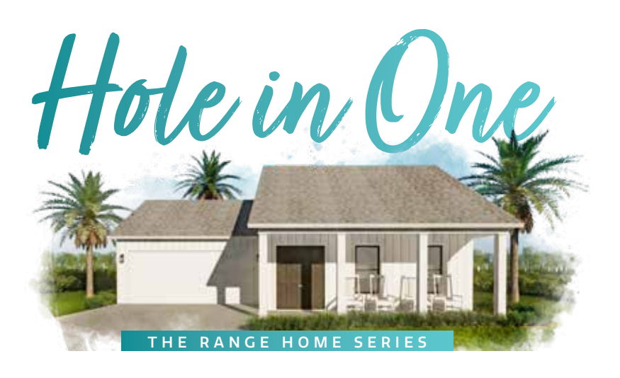
4 bed | 3 bath | 2 car garage | 3425 total sq. ft. | 2355 sq. ft. under air