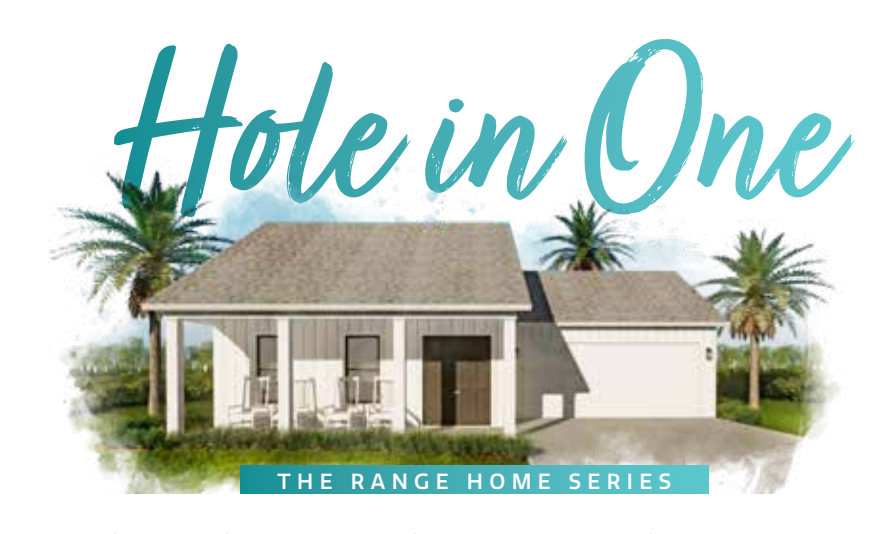
4 bed | 3 bath | 2 car garage | 3425 total sq. ft. | 2355 sq. ft. under air