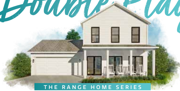
THE RANGE HOME SERIES

5 bed | 3.5 bath | 2 car garage | 3945 total sq. ft. | 2989 sq. ft. under air