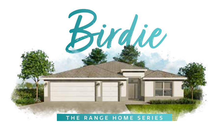
3 bed | 2 bath | 2 car garage + golf car garage | 2762 total sq. ft. | 1929 sq. ft. under air