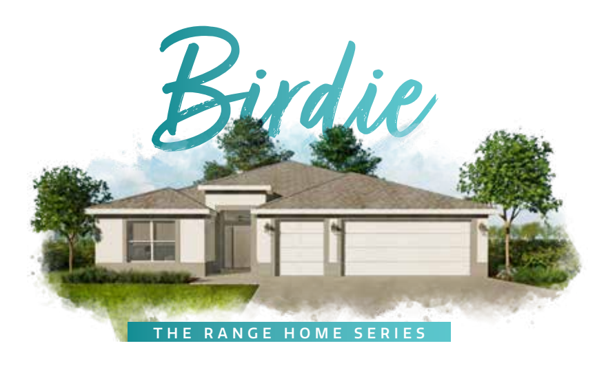
3 bed | 2 bath | 2 car garage + golf car garage | 2762 total sq. ft. | 1929 sq. ft. under air