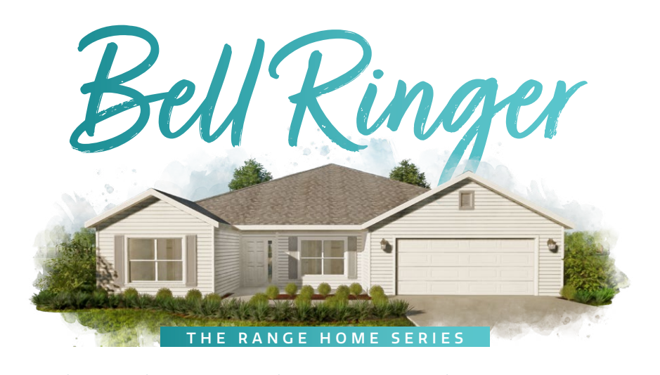
4 bed | 2 bath | 2 car garage | 2830 total sq. ft. | 2004 sq. ft. under air