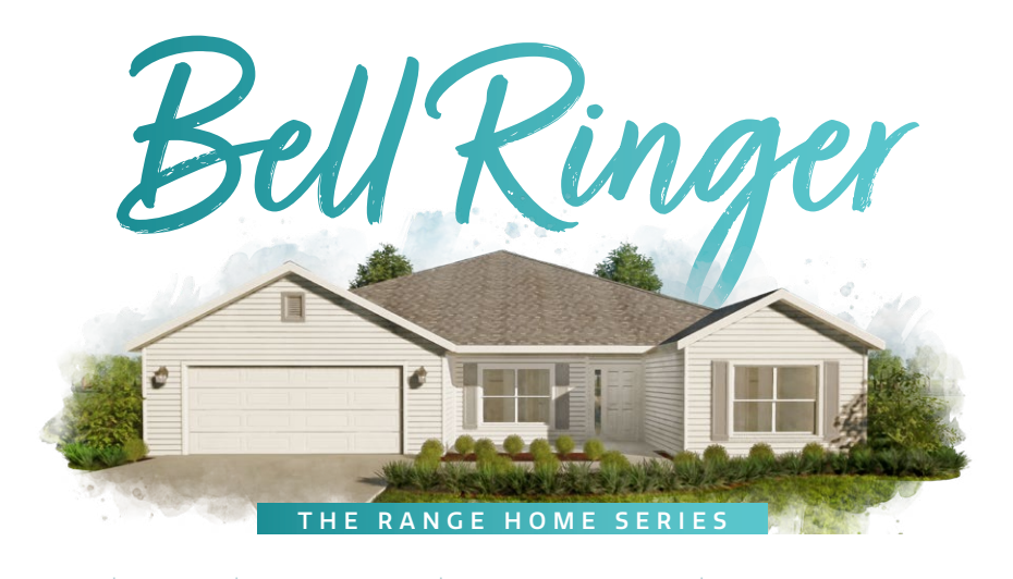
4 bed | 2 bath | 2 car garage | 2830 total sq. ft. | 2004 sq. ft. under air